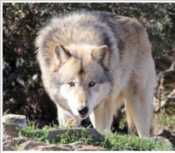
The California Wolf Center plays an active role in wild wolf conservation.