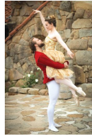
Turning Pointe School of Dance Presents Cinderella