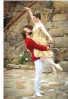
Turning Pointe School of Dance Presents Cinderella