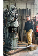
Local Blacksmith Forges Ahead with Age-Old Trade