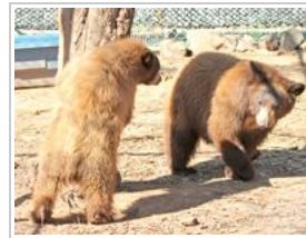
Black bear cubs at The Fund for Animals Wildlife Center in Ramona are being rehabilitated for release.

Emergency Animal Rescue assists concerned residents by physically rescuing animals in need — both wild and domestic. They may be contacted by email at ear@rescueteam.com , or visit their website at www.emergencyanimalrescue.org . They have someone available 24/7 to answer questions or respond to a