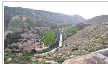
View of San Pasqual Valley from trail.

As it is usually uncrowded, the trail is a wonderful opportunity to get away from the daily grind and enjoy a bit of nature — and