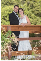
LA Couple Ties the Knot at Ramona Oaks RV Resort