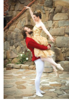
Turning Pointe School of Dance Presents Cinderella