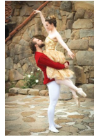
Turning Pointe School of Dance Presents Cinderella