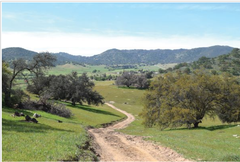
The Santa Ysabel County East Preserve's West Vista Loop Trail brings hikers through beautiful shady oak groves.

By Angela McLaughlin - Ramona Home Journal • Thu, Apr 20, 2017