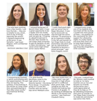
JHS ~ One Look Back, Two Looks Forward