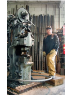
Local Blacksmith Forges Ahead with Age-Old Trade