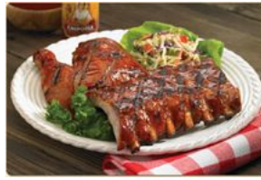
Get Ready for Ribs!