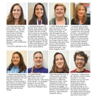
JHS ~ One Look Back, Two Looks Forward